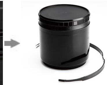
Tear off the tamper evident strip.