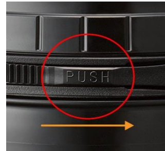
Press "PUSH" on the cap to raise the tamper evident strip, and tear the strip in the direction of the arrow.