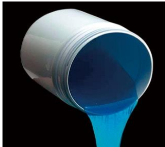
The wide diameter helps make full use of the contents without waste.