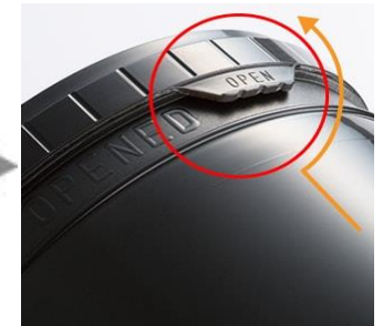
Raise the "OPEN" hinge on the cap with your finger to unlock, and remove the cap.