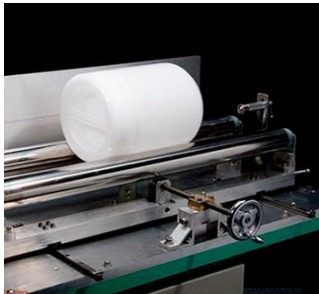
Its straight cylindrical shape allows the container to be used for horizontal mixing. *excluding BHM-600