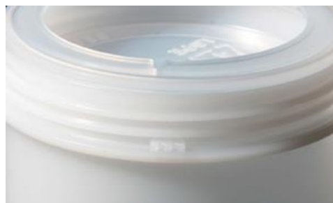
With ratchet(No.150 RS)

An anti-oxidation floating lid is available as an option to prevent the surface of paste materials from drying off.