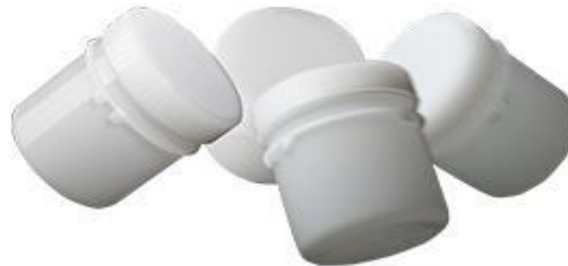
<Mixing Container 002>

This model has three equally-spaced pairs of claws attached to its flange portion for fastening it to the fixture inside the mixer. This feature effectively prevents the container from becoming loose during mixing operations.