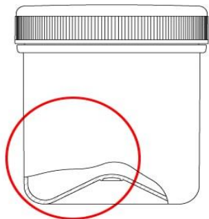
<Mixing Container 001>

It has a concave base to boost mixing efficiency.